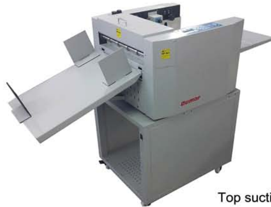
Top suction pile feed (shown with optional stand)