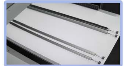
Slide in tools