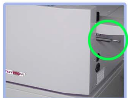
Tool storage slot