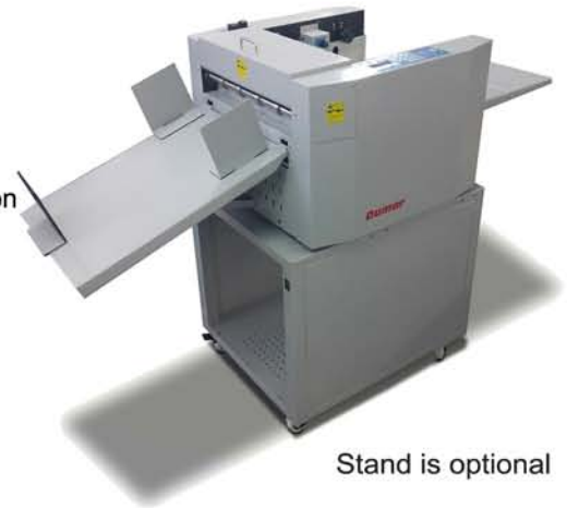
Stand is optional