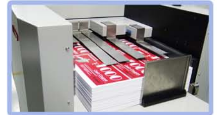
335B pile feeder